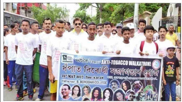
Participants at an anti-tobacco rally in Guwahati on Sunday.

5. 5 th June 2017 : World Environment Day celebration started at S B Deorah College through Street Play and plantation of 100 valuable plants with tree gourds at various schools and Colleges and locations of Guwahati.