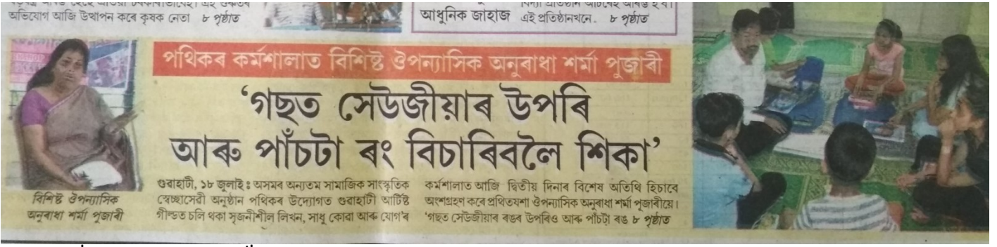
18. 2 nd August 2018 : 15 th Foundation Day of Pathik at Office