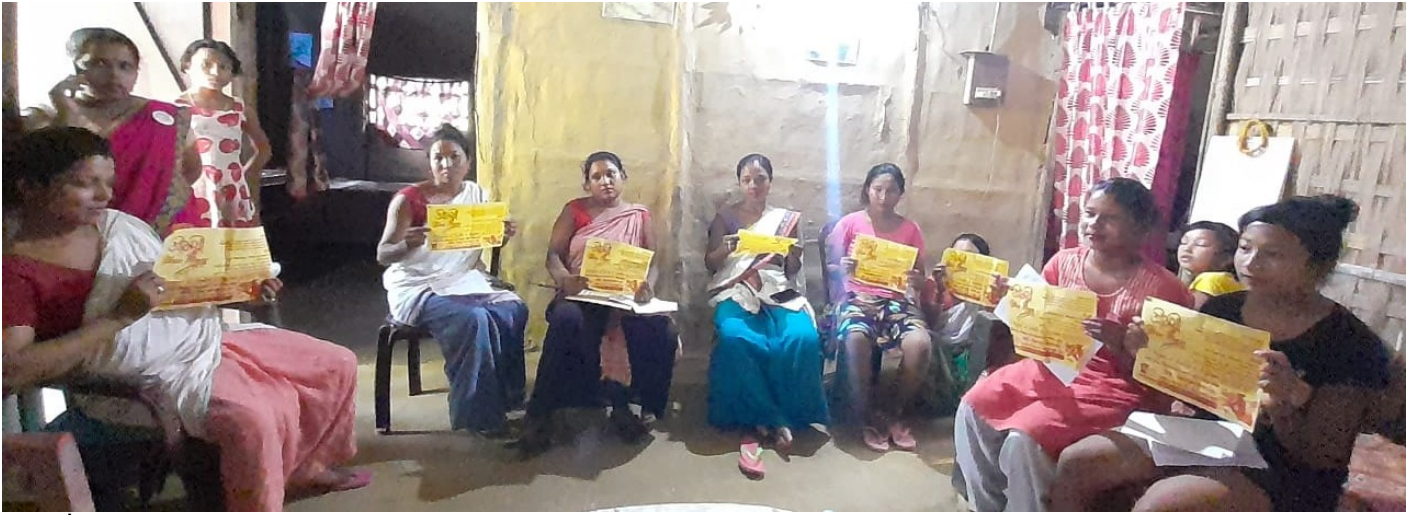
35. 4 th September, 2020: Awareness on Women Hygiene through Project Shreemoyee at Dhekiakhuwa nad Moinaporia, Jorhat