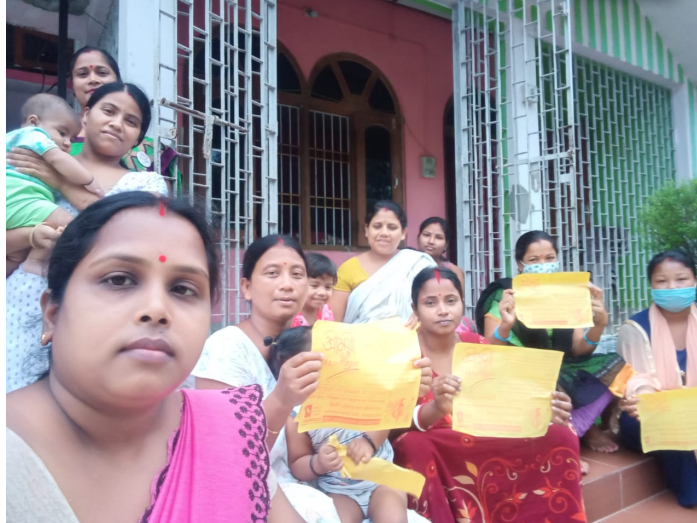
56. 28 th October, 2020 : Awareness on Women Hygiene through Project Shreemoyee at Charigaon of Jorhat