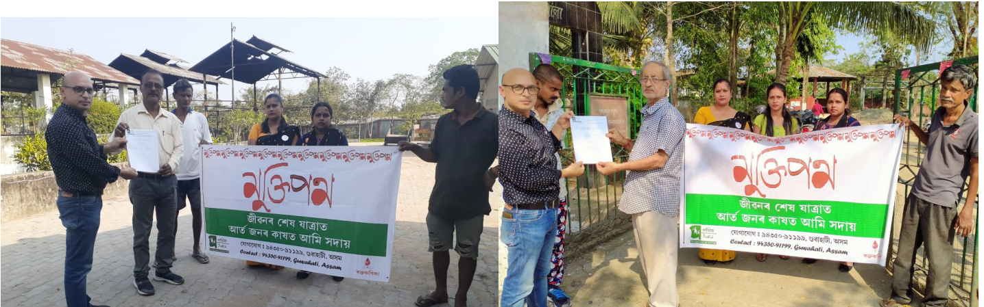
92.14-March-2021: Awareness on Women Hygiene at Borbhethi Gaon