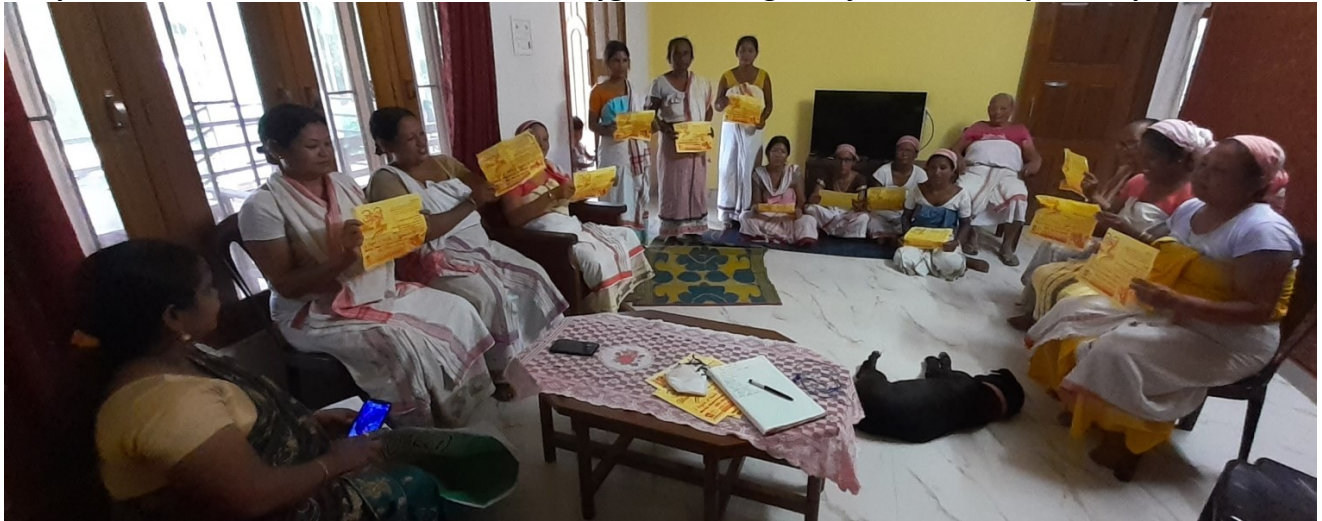
38. 7 th September, 2020: Awareness on Women Hygiene through Project Shreemoyee at Nakachari, Jorhat