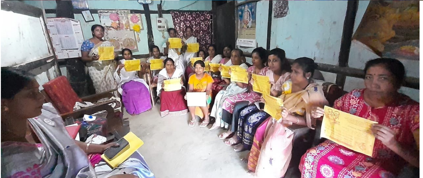
48. 8 th October, 2020 : Awareness on Women Hygiene through Project Shremoyee at Atilagaon, Jorhat