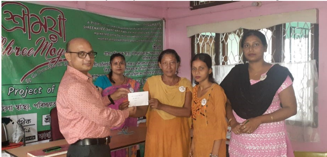
48. 6 th October, 2020 : Awareness on Women Hygiene through Project Shreemoyee at Meleng of Jorhat