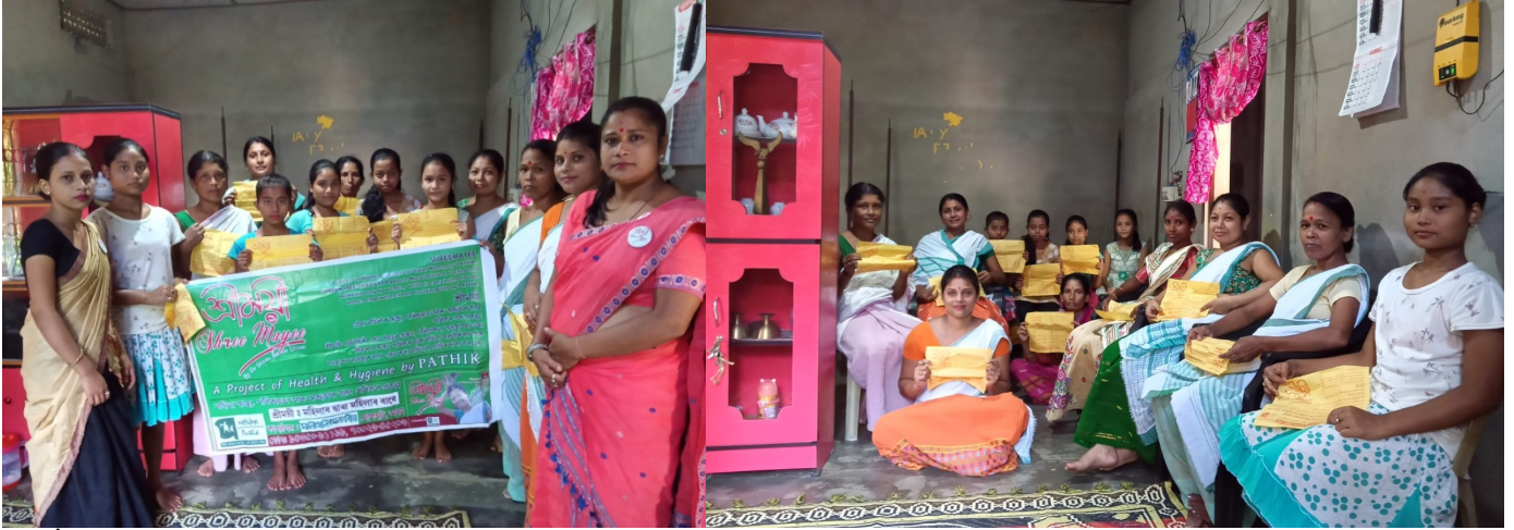
55. 22 nd October, 2020 : Awareness on Women Hygiene through Project Shreemoyee at Saumar Path of Jorhat