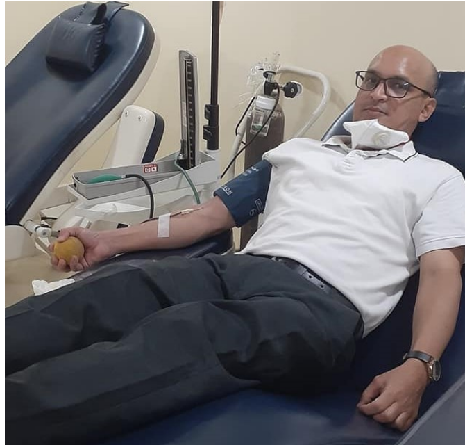
29. 14 th August, 2020 : Blood donation and arrangement for a patient at GMCH, Guwahati