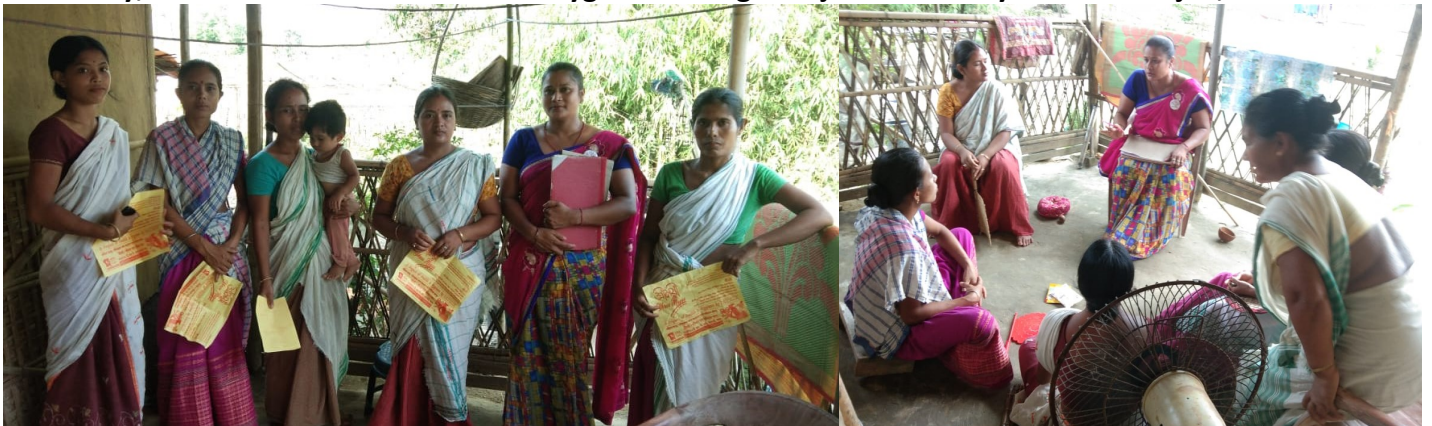
24. 07 th July, 2020 : Awareness on Women Hygiene through Project Shreemoyee at Dhekiakhuwa, Jorhat