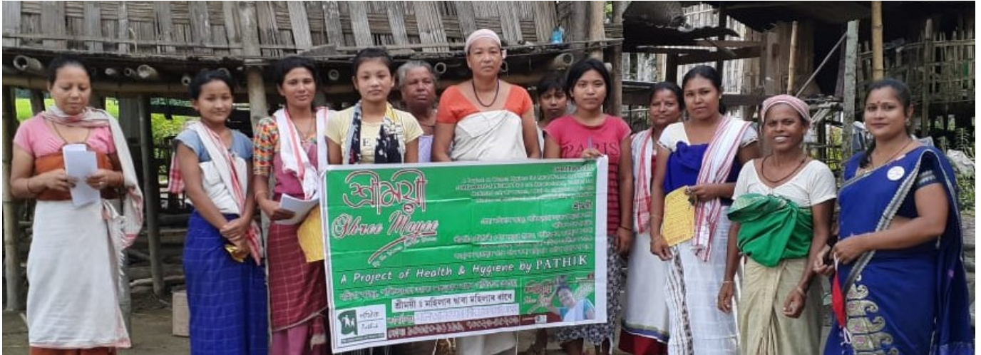
45. 4 th October, 2020 : Awareness on Women Hygiene through Project Shreemoyee at Neog-Chuk, Jorhat