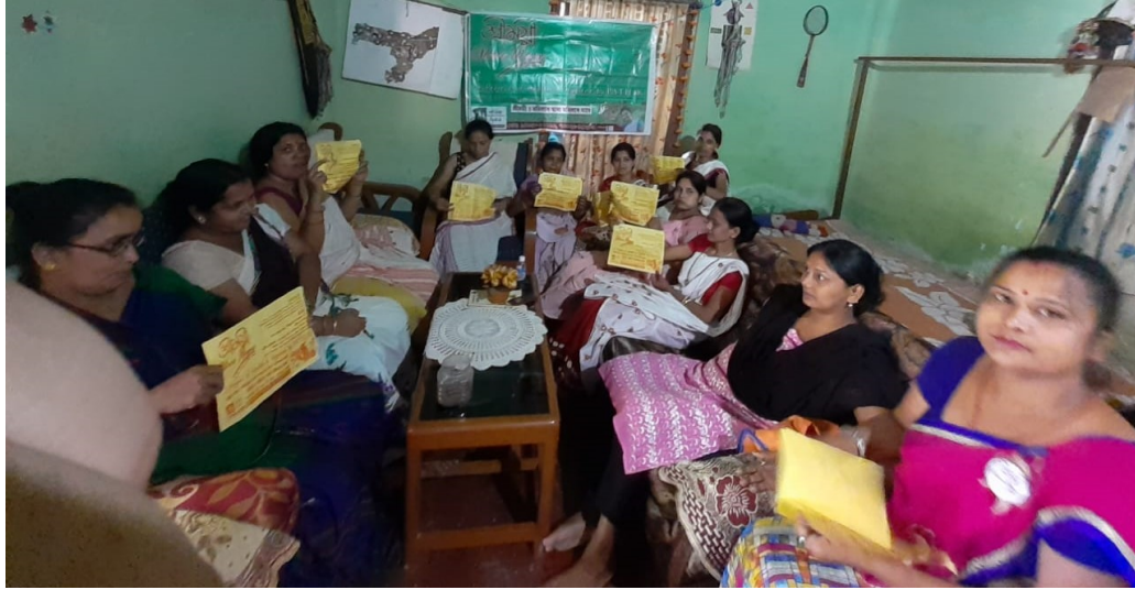
23. 3 rd July, 2020 : Awareness on Women Hygiene through Project Shreemoyee at Dhakiajuli, Jorhat