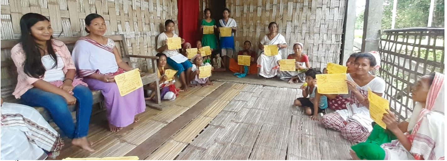
44. 4 th October, 2020 : Awareness on Women Hygiene through Project Shreemoyee at Nam-Deuri, Jorhat