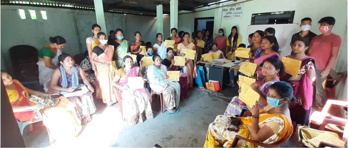
50. 12 th and 13 th October, 2020 : Production Machine (sanitary Pad) Installation for Project Shreemoyee Jorhat with Enginner from Udaipur, Rajasthan.