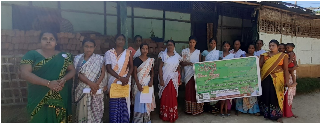
53. 20 th October, 2020 : Awareness on Women Hygiene through Project Shreemoyee at Baligaon, Jankhana and Bhaboli Chuk of Jorhat.