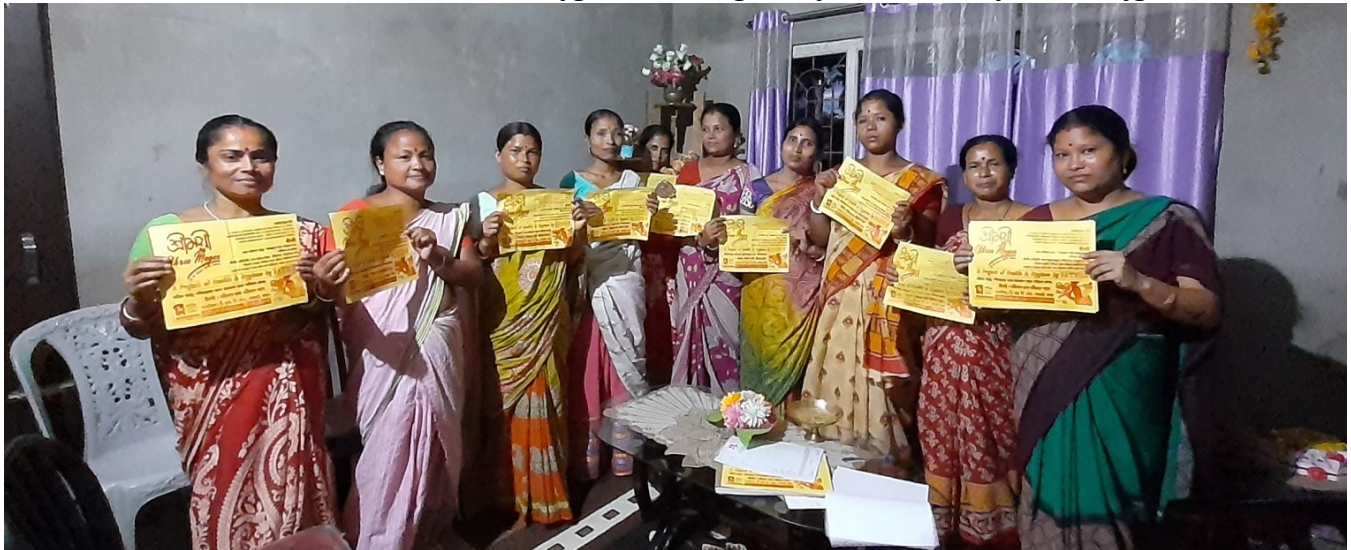
18. 15 th June, 2020 : Awareness on Women Hygiene through Project Shreemoyee at Lahdoi Garh, Jorhat