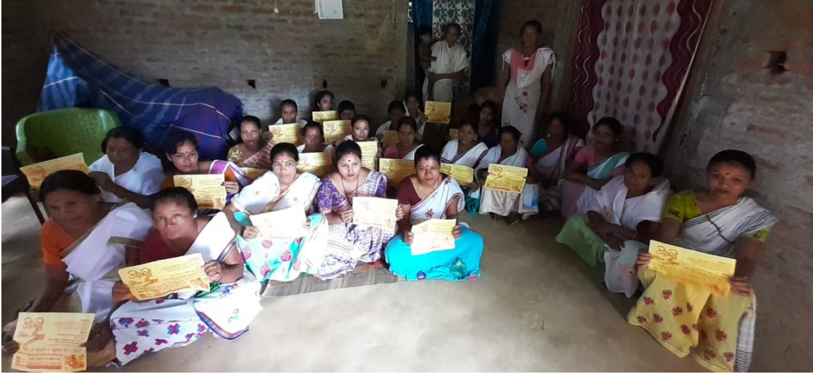
37. 7 th September, 2020: Awareness on Women Hygiene through Project Shreemoyee at Upor Deuri, Jorhat